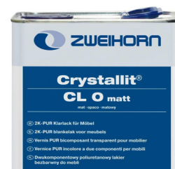
Zweihorn Crystallit 2K- PUR CL0